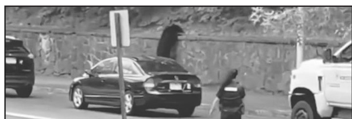
Smarter Than the Average Bear?

A young black bear visited two Massachusetts schools as it wandered through Worcester with police in pursuit.