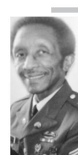
Pres Hall Columnist

More so, God provided us with the perfect staying quarter area, everything necessary and unnecessary were available, even two game rooms and BBQ grill and outdoor space. Only God could have put the right people in the right places to help in facilitating this amazing trip. Every day was preplanned perfectly, and we did so much in that given time. Our 1st day, we toured the African American Museum, quite interesting and exciting but