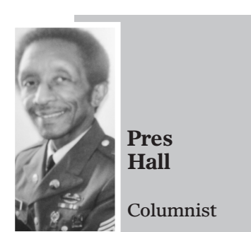
Pres Hall Columnist

Today I'm overly concerned, disturbed and heavily saddened as I watched the South Georgia Wildfires news for the past days. It has been more than a week since wildfire has ripped, destroyed and ravished everything in its path. I've seen it in the other parts of the country but not in Georgia. These unprecedented and unpredictable fires in Clinch and Brantley Counties, Hwy 82 have caused severe, devastating damage in more ways than one. Unfortunately, more than 120 homes, including other structures, and vehicles have been burned to the ground. Unbelievable, but so, more than 50 thousand acres torched as the fires were reported, doubled last night. These blazing fires are fueled by leftover debris from Hurricane Helene. One dealership alone, lost more than 300 vehicles but grateful and thankful to God, as of now only one life, a firefighter, and we pray for his family. Understandably these courageous, relentless firefighters are exhausted yet