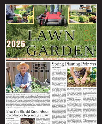
2026 Lawn & Garden Special Section