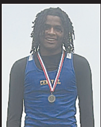
CEHS Track & Field team advances to Sectionals