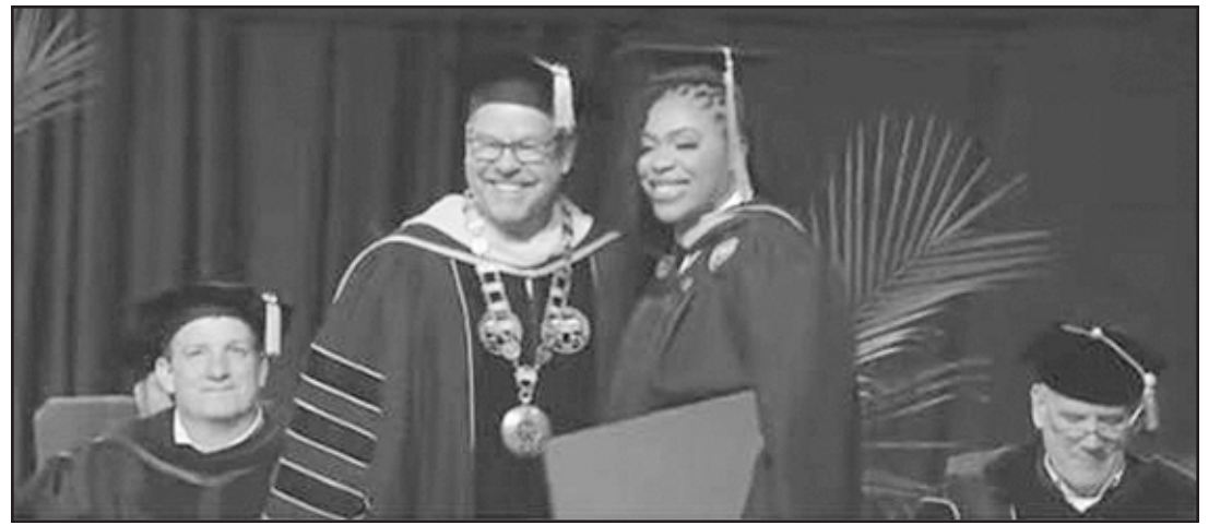
Submitted By Pres Hall

Thank you for your support of the New Era newspaper and the Talbot County community.